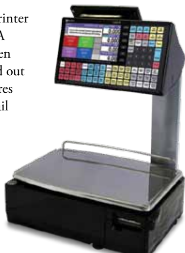
Elevated keyboard and displays type

The Uni-5 is more than just attractively priced. It's also attractive in design, with a polished, black polymer housing that's easy to clean, and a convenient side-loading printer for quick label changing. A low-profile design and green energy consumption round out a long list of essential features for today's progressive retail marketplace.