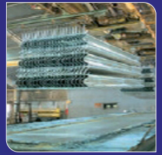
Modular Design with galvanized structure