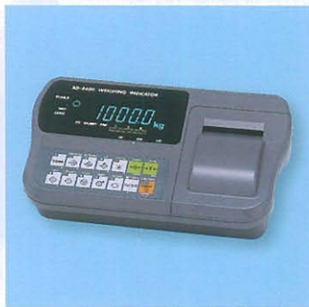
Model AD-4405 Weighing Indicator.