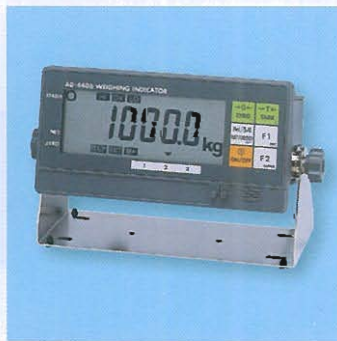
Model AD-4406 Weighing Indicator.