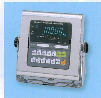
Model AD-4407 Weighing Indicator.