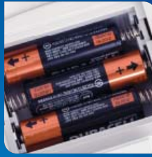
Used anywhere with battery power