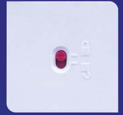
Load cell lock & adjustable footing